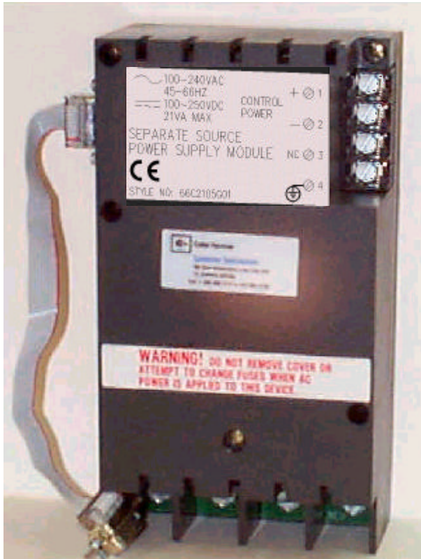
Fig. 1 Separate Source Power Module